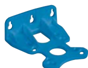
-S- wall bracket