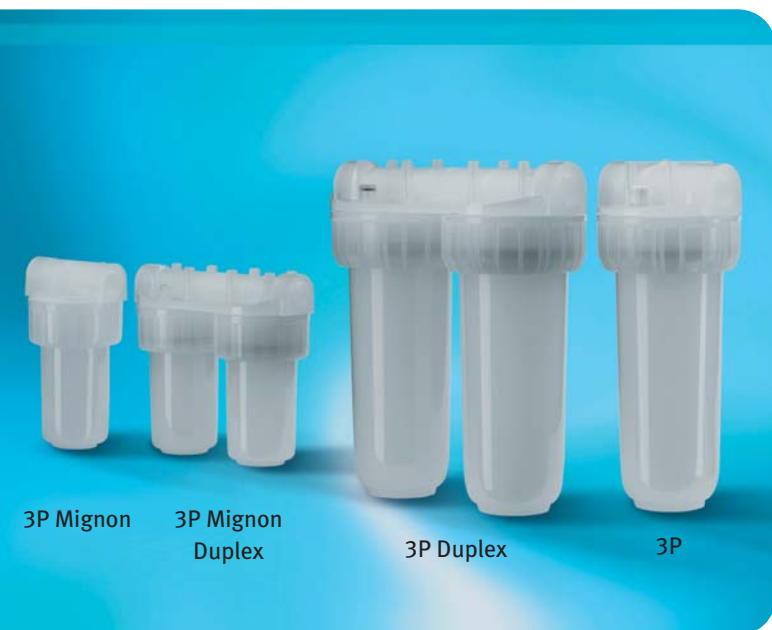
3P Mignon 3P Mignon Duplex

RO2-09/07. Subject to change without notice